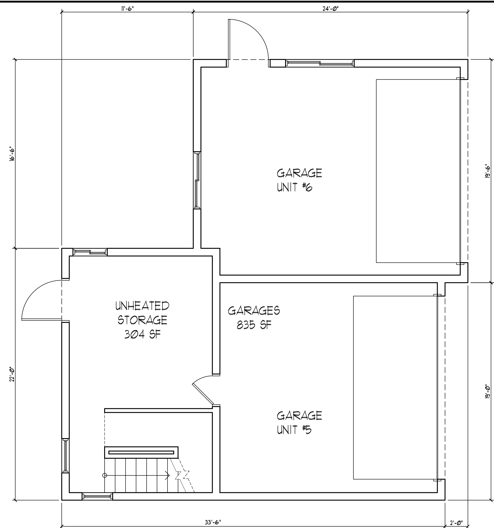
1 11-106 Basement 05 SCALE: 1/4"=1' 1139 SF (UNHEATED)