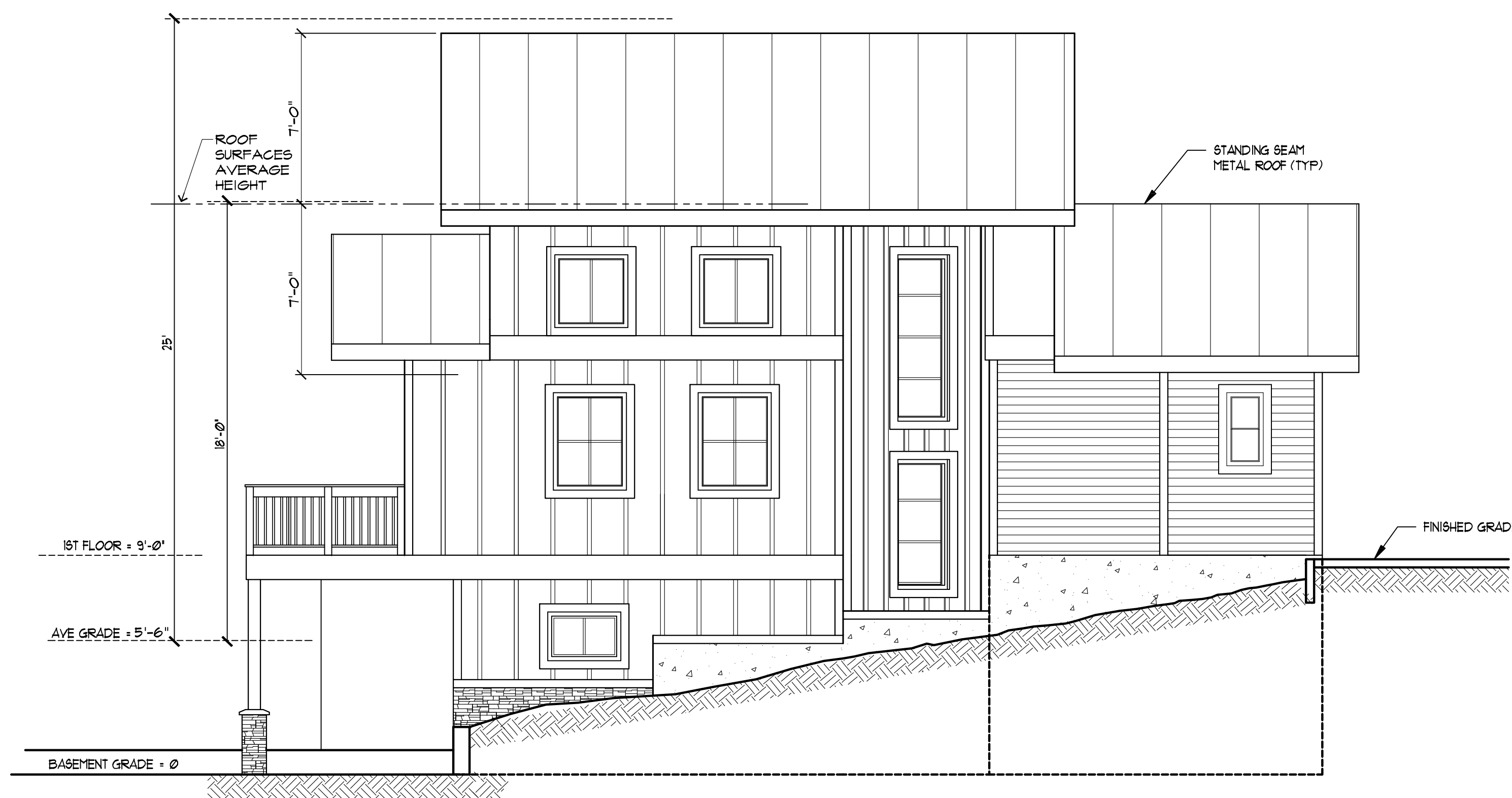
3 SOUTH ELEVATION 1/4" = 1'-0"