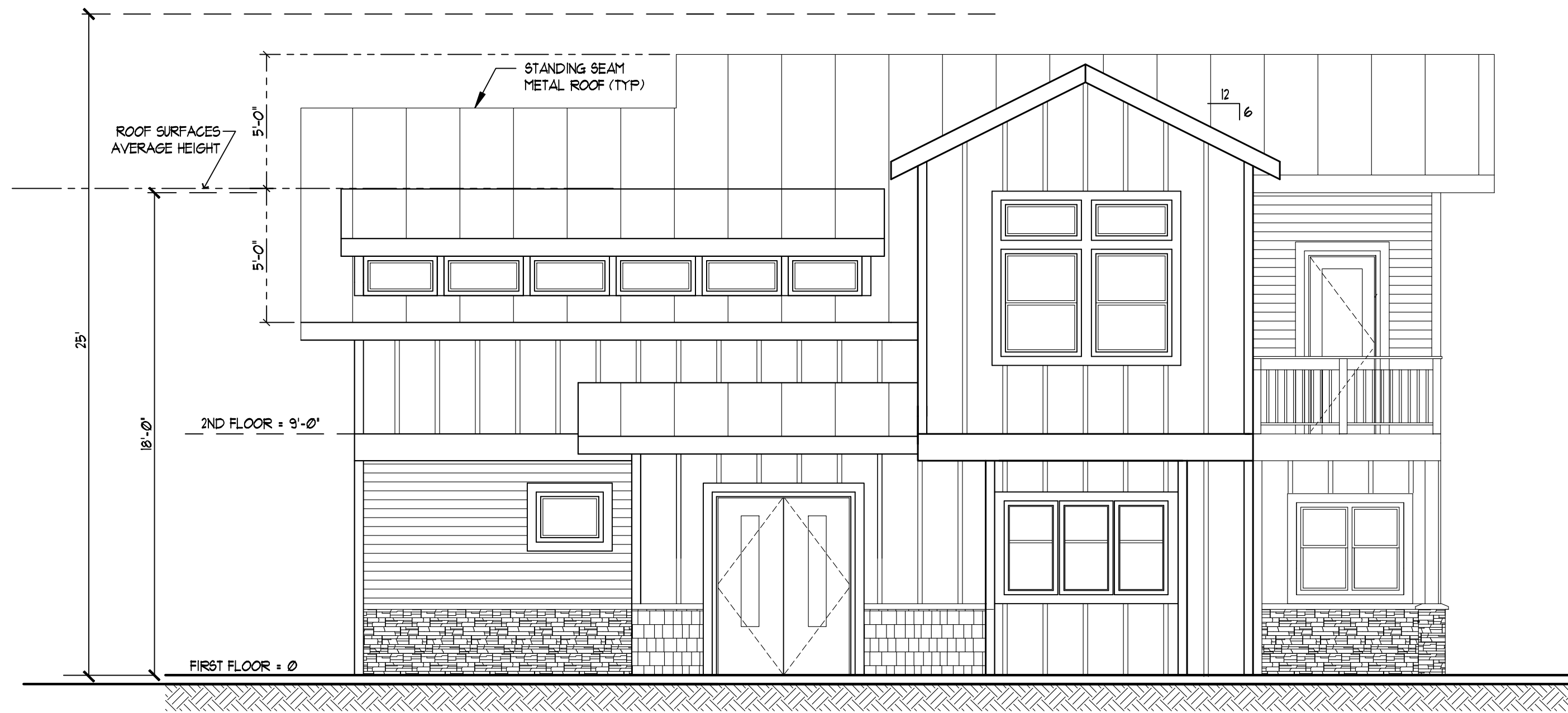
1 NORTH ELEVATION 1/4" = 1'-0"