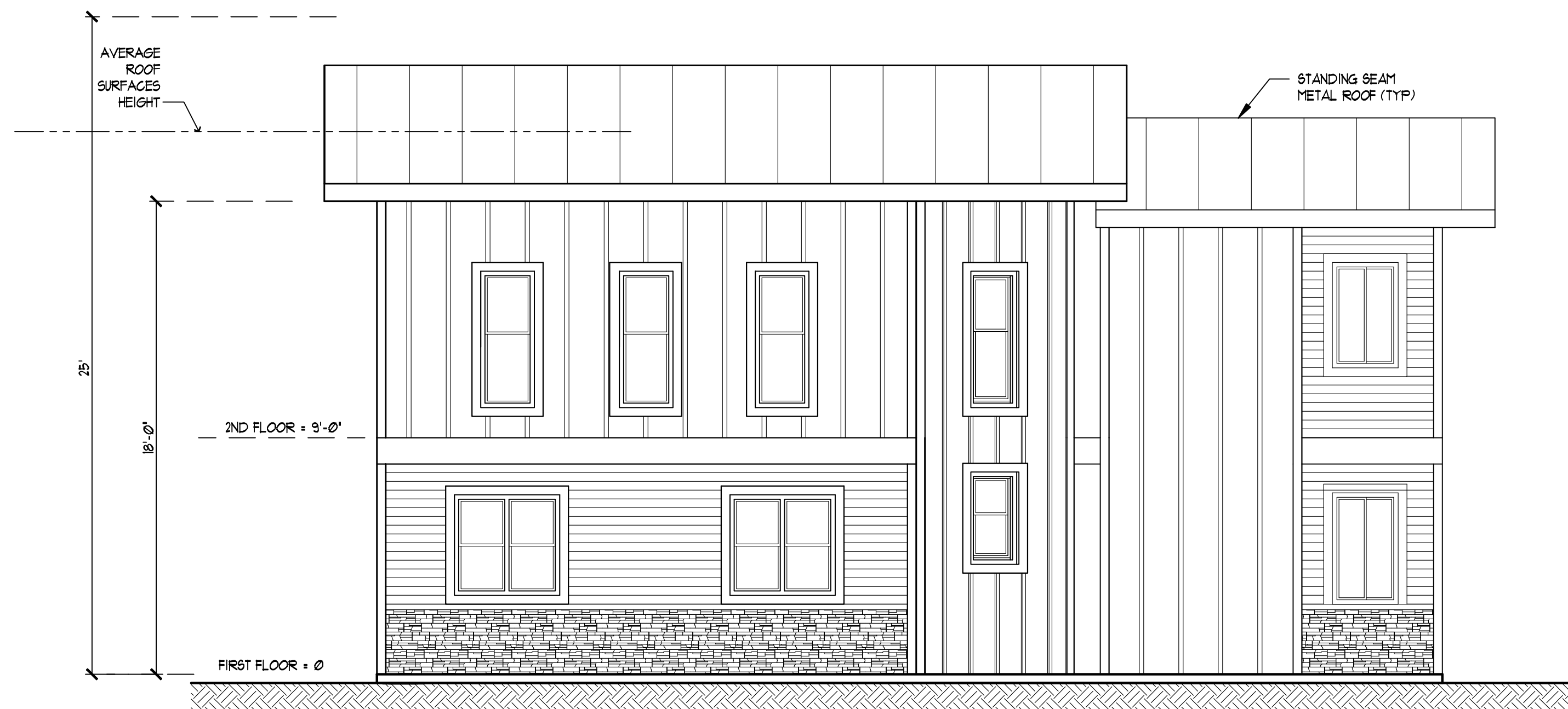
3 SOUTH ELEVATION 1/4" = 1'-0"