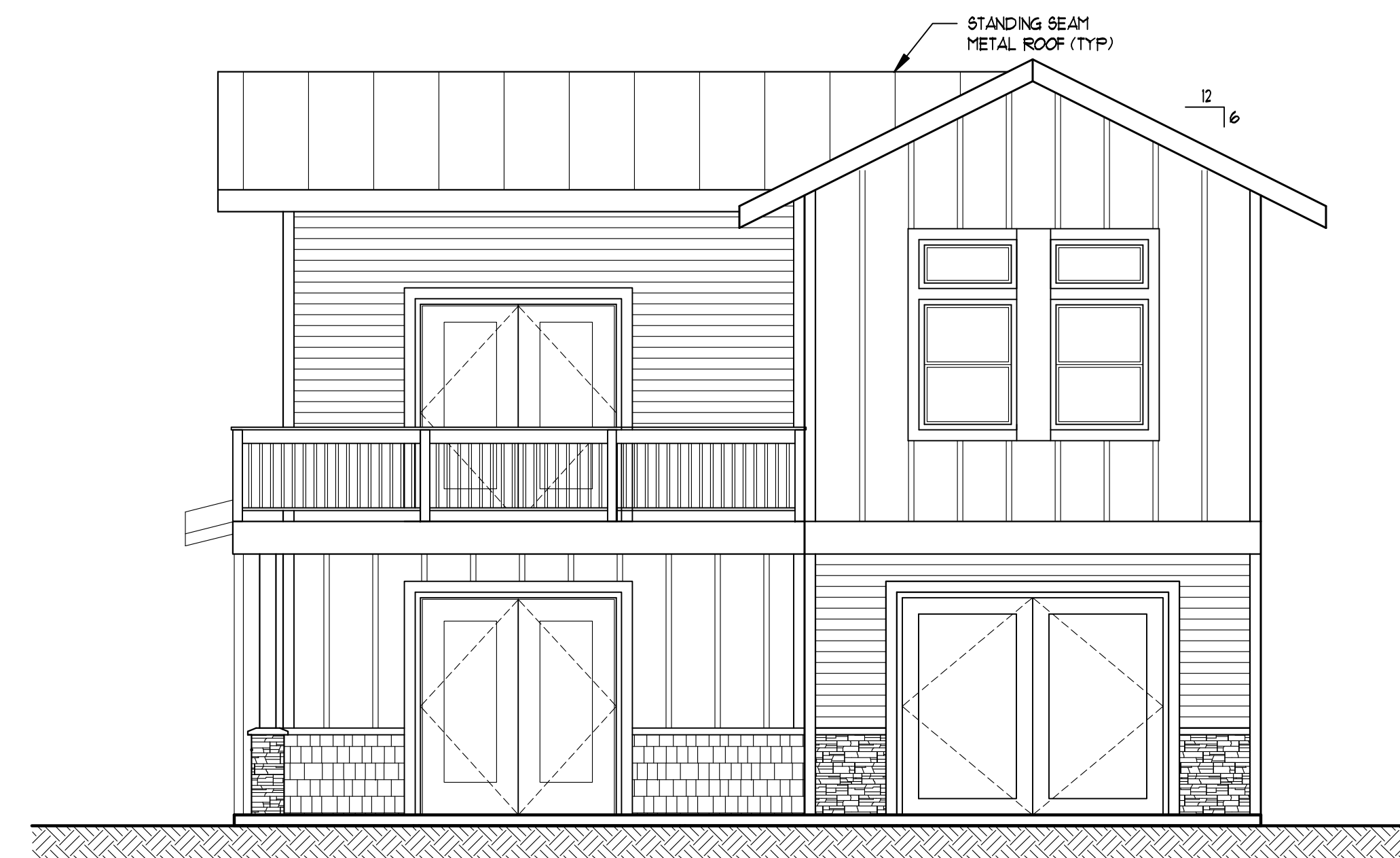
4 WEST ELEVATION 1/4" = 1'-0"