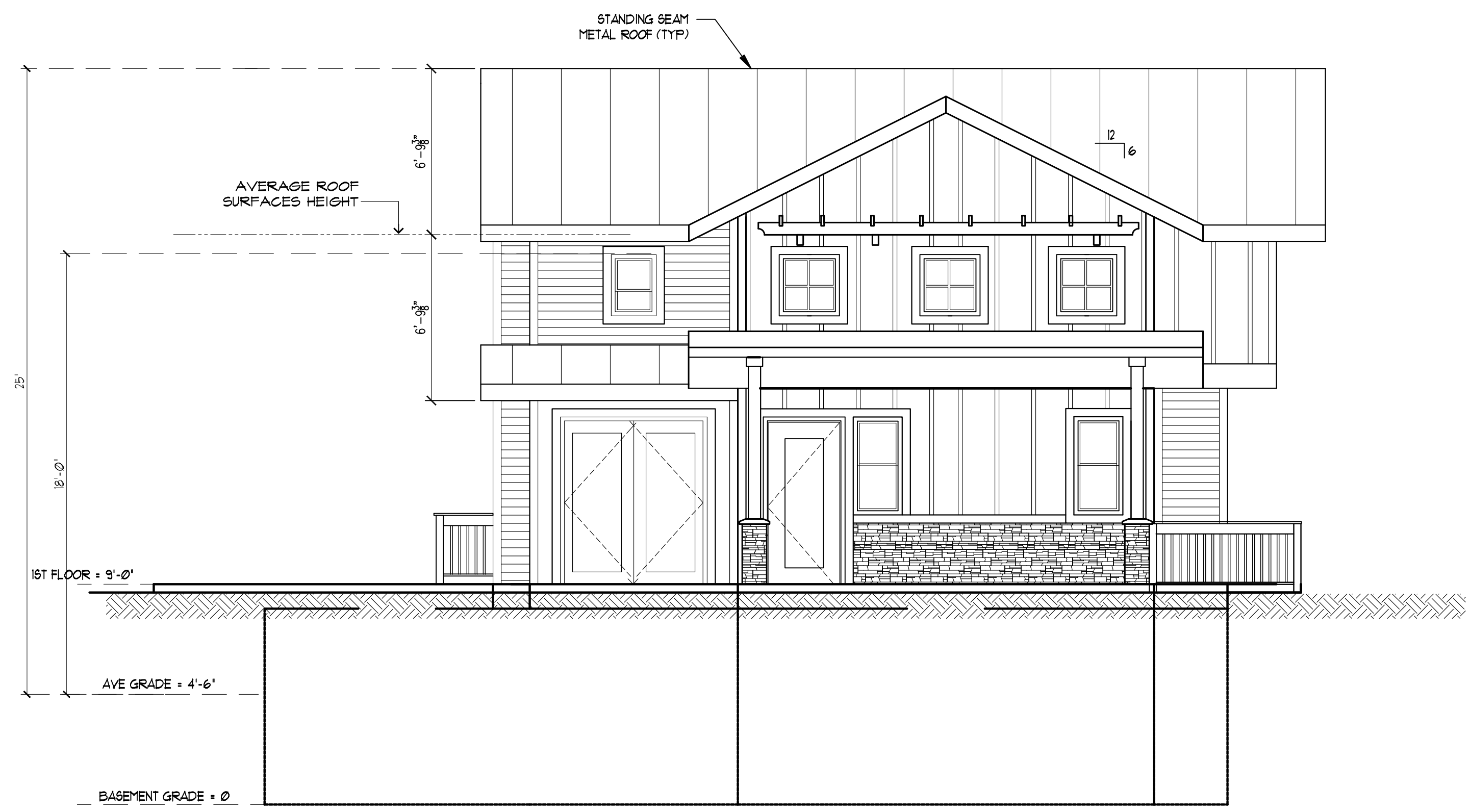
3 SOUTH ELEVATION 1/4" = 1'-0"