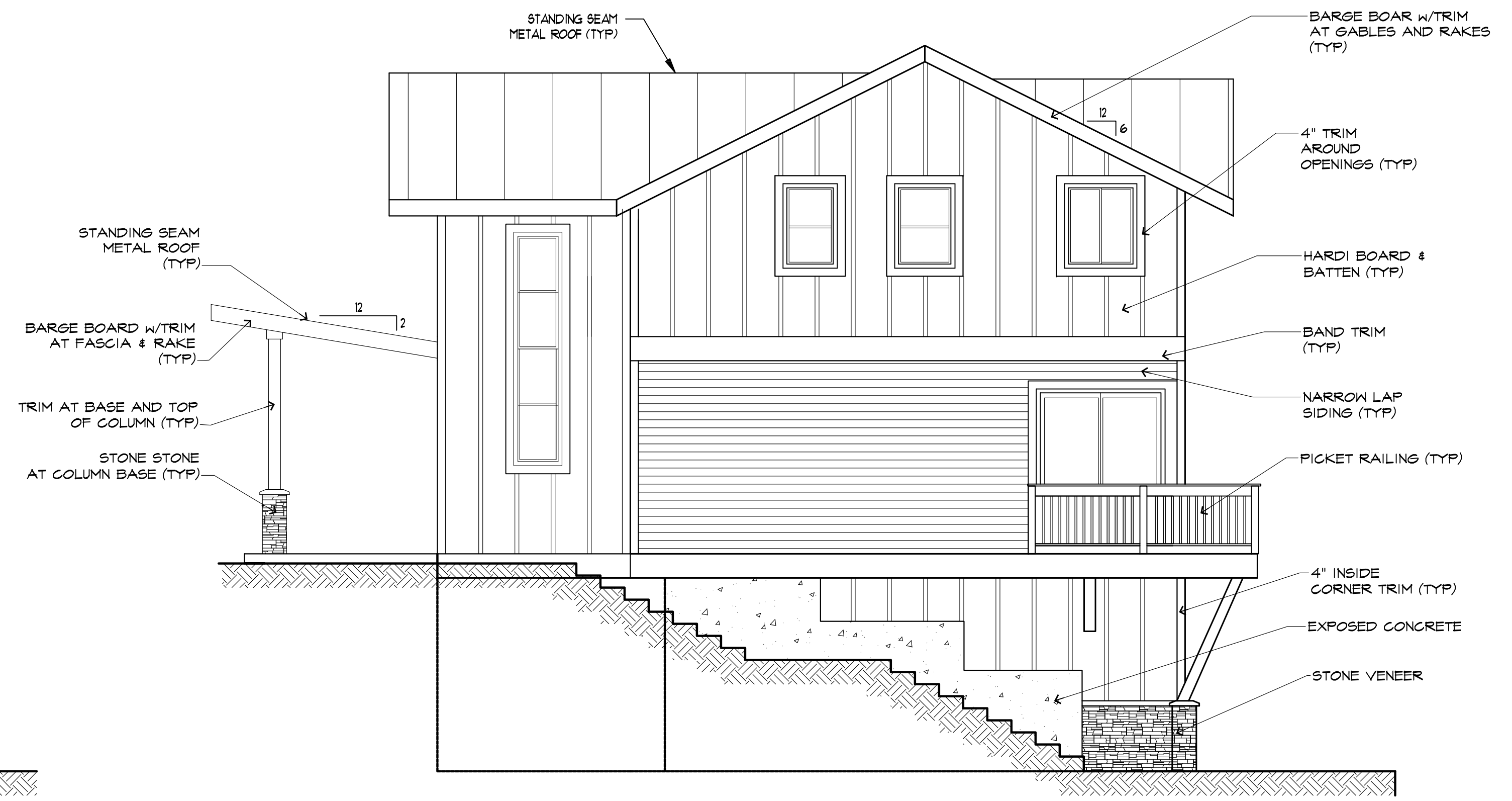
2 EAST ELEVATION 1/4" = 1'-0"